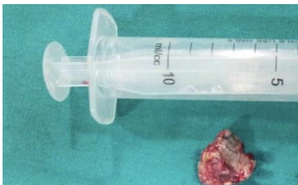
Figure 3: Gross specimen